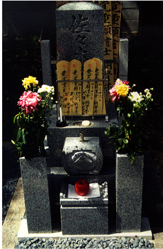
Figure 7. A family grave with offerings.