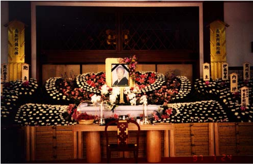
Figure 1. Funeral altar.