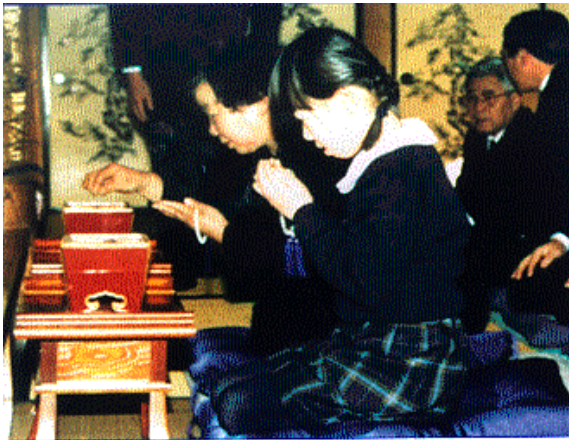
Figure 3. Incense offering by relatives of the deceased.

mourners may sit down and then stand up to burn incense (Figure 3). The chief mourner ( moshu 喪主) may make a short speech to the mourners, and the closest friends and relatives may share a meal afterwards. Often enough nowadays, in the case of a natural death in old age, mourners who were not close to the deceased arrive, sub-