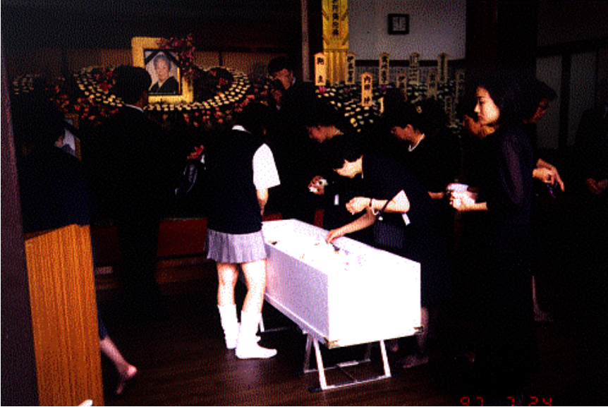
Figure 4. Placing flowers in the coffin.

the coffin around the body of the deceased (Figure 4). A wooden staff (to aid on the post-mortem journey) or items of significance to the deceased (e.g., books, eyeglasses, food) may be placed in the coffin. The coffin is closed and mourners symbolically pound a nail into the coffin using a stone. The coffin is then carried on men's shoulders from the house or temple to the hearse (Figure 5). Finally, the chief