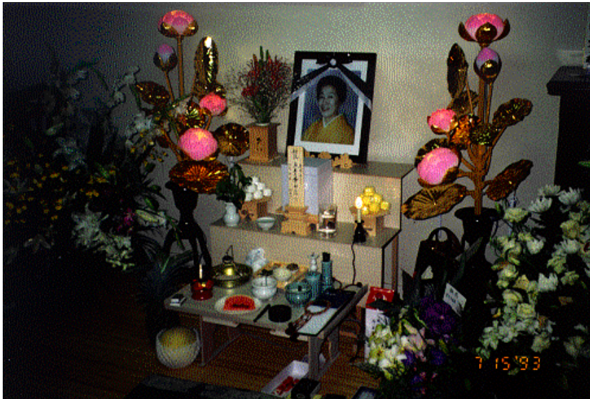
Figure 6. A post-funeral altar.