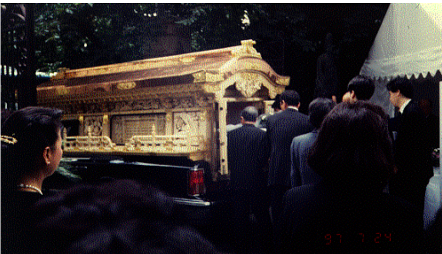
Figure 5. Departure of the hearse.

the coffin around the body of the deceased (Figure 4). A wooden staff (to aid on the post-mortem journey) or items of significance to the deceased (e.g., books, eyeglasses, food) may be placed in the coffin. The coffin is closed and mourners symbolically pound a nail into the coffin using a stone. The coffin is then carried on men's shoulders from the house or temple to the hearse (Figure 5). Finally, the chief